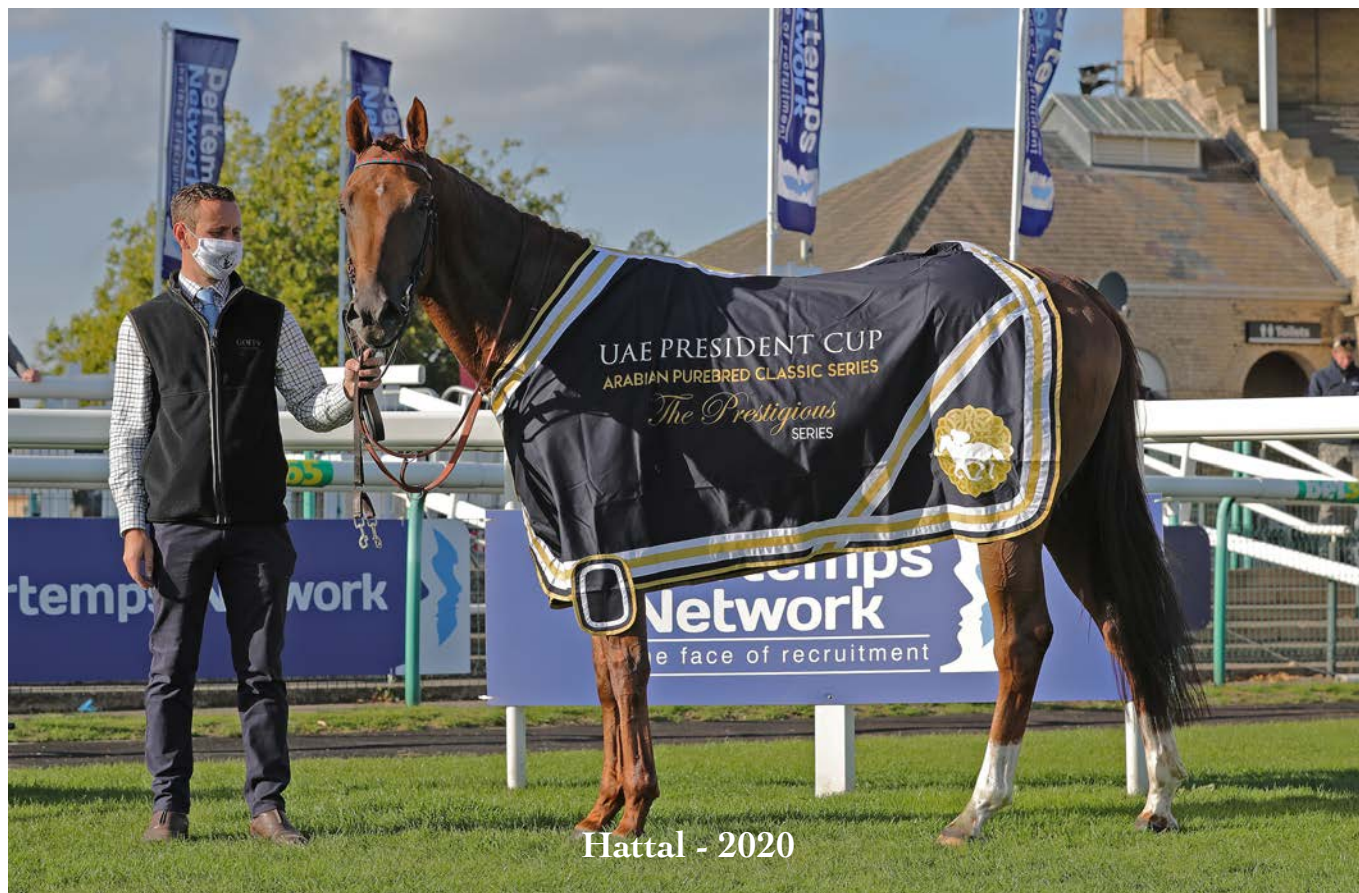
Hattal - 2020