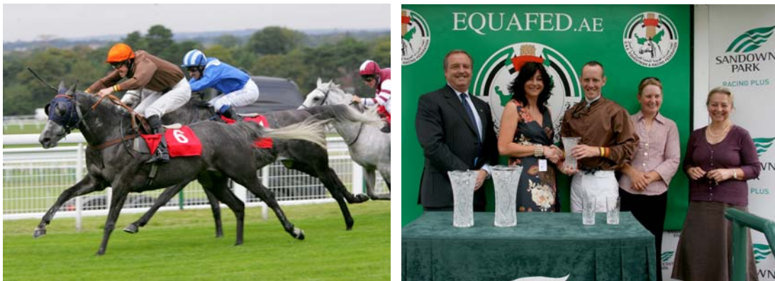
UAE Equestrian & Racing Federation Single Race Sponsorship at Sandown Park 2007

ARO has attracted foreign runners from several European countries for a number of years, due to the quality both of the racing and also the racecourses where Arabian Racing is hosted. However, in addition to this, we are now beginning to attract owners from various countries in the Middle East, who have selected the UK as the country in which to campaign their horses over the summer. This, in addition to bringing an extra element of competition to our racing, will provide companies with the ideal opportunity to access these potential clients.