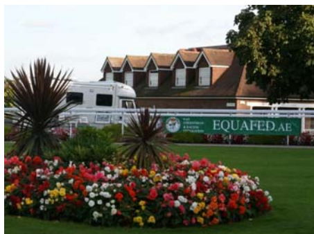
UAE Equestrian & Racing Federation branding at Sandown Park 2007